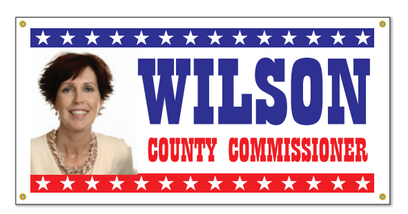
No. 1168 8 ft. x 4 ft.

There are no art charges for orders with approved digital art. Add $51.00(C) for artwork that does not meet specifications.