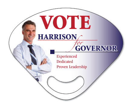
No. 6593 8 1/4" x 6 5/8"