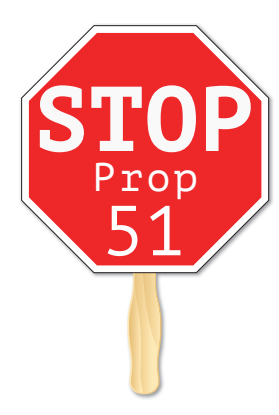
8 ½" x 8 ½" Octagon No. 627 Spot Color No. 1627 4-Color Process