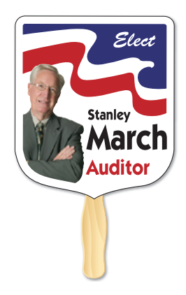
7 1/4" x 8 3/8" Shield No. 617 Spot Color No. 1617 4-Color Process