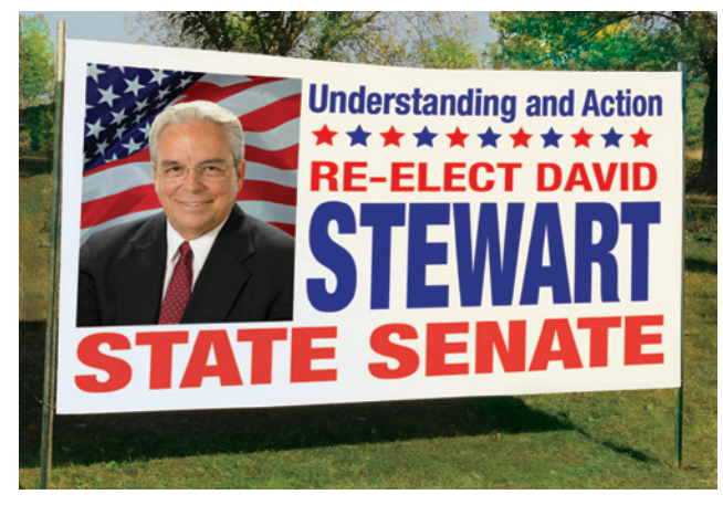
No. 7781 96" x 48"

Signs can be attached to "T" posts using a heavy gauge steel wire. Steel posts are available at building supply and hardware stores.