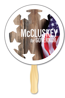
8 ½" dia. Circle No. 620 Spot Color No. 1621 4-Color Process