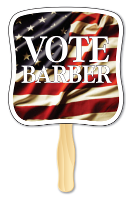
7 ½" x 7 ¼" Hourglass No. 611 Spot Color No. 1611 4-Color Process

There are no art charges for orders with approved digital art. Add $51.00(C) for artwork that does not meet specifications.