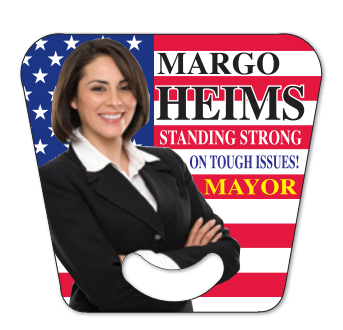
No. 6592 6 5/8" x 6 1/8"