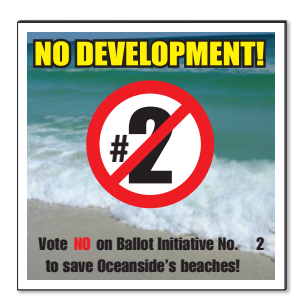
No. 7779 48" x 48"

Allow for a 1" non-bleed border on all sides. There are no art charges for orders with approved digital art. Add $51.00(C) for artwork that does not meet specifications.